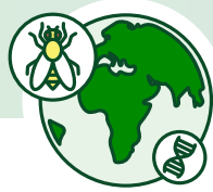
Environmental Adaptation Genomics in Drosophila (regional focus)