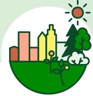
Urban adaptation to climate change (urban focus)