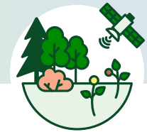
Validation of Phytosociological Methods (urban/regional focus)