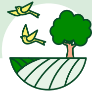
Biodiversity and agriculture nexus (regional focus)