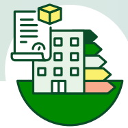
Spatial and temporal assessment of neighborhood building stock (urban focus)